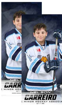
2 - BOOKMARKS