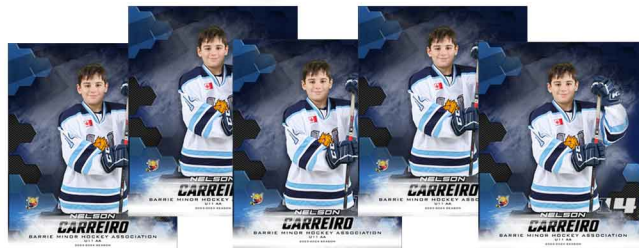
5 TRADING HOCKEY CARDS