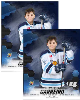
2 - 5x7 PORTRAIT PRINTS