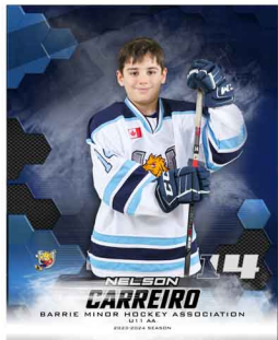
1 - 8x10 PORTRAIT PRINT